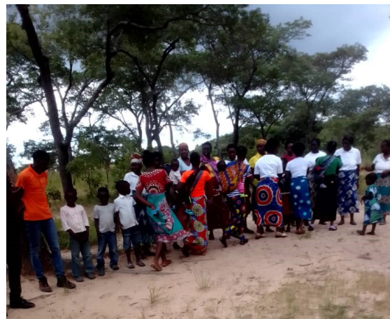
Farewell greeting after worship service at Macha church.