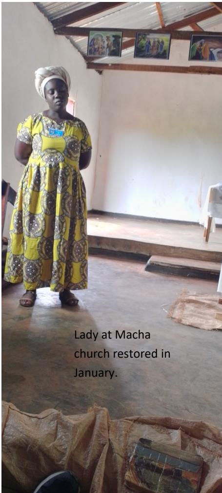
Lady at Macha church restored in January.